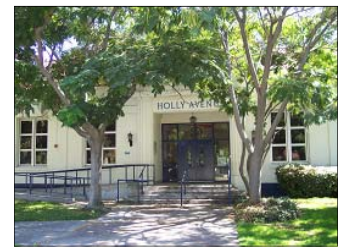
Holly Avenue Elementary