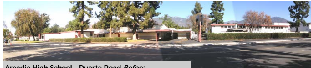
Arcadia High School - Duarte Road Before

Phase One projects include the Arcadia High School Science Center on the Duarte Road side of the campus and the Student Services Center on the Campus Drive side. Temporary classrooms are due to arrive in December with demolition and groundbreaking set for the summer of 2008.