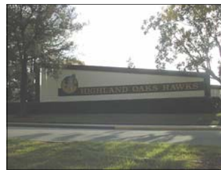
Highland Oaks Elementary