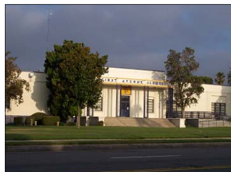
First Avenue Middle School

Phase One also includes design work and planning for projects at First Avenue Middle School, Highland Oaks Elementary and Holly Avenue Elementary.